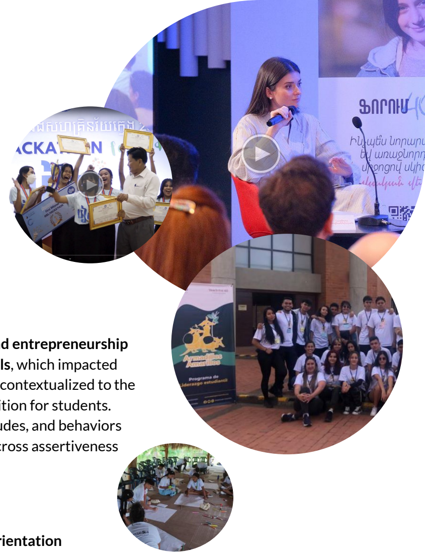
Pictures from Teach For Cambodia's Business Pitch Competition (left), FORUM405 (top right), and Armadillos Amarillos (bottom two on the right)

DHL funding strengthened Enseña por Colombia's socio-occupational orientation program . More than 90 students were impacted by 22 DHL volunteers as a result. Armadillos Amarillos —one of Enseña por Colombia's core programs—engaged students in seven regional leadership bootcamps. Over the course of three days, these bootcamps impacted 185 students who together with their 44 teachers , engaged in hands-on experiences around personal and collective leadership.