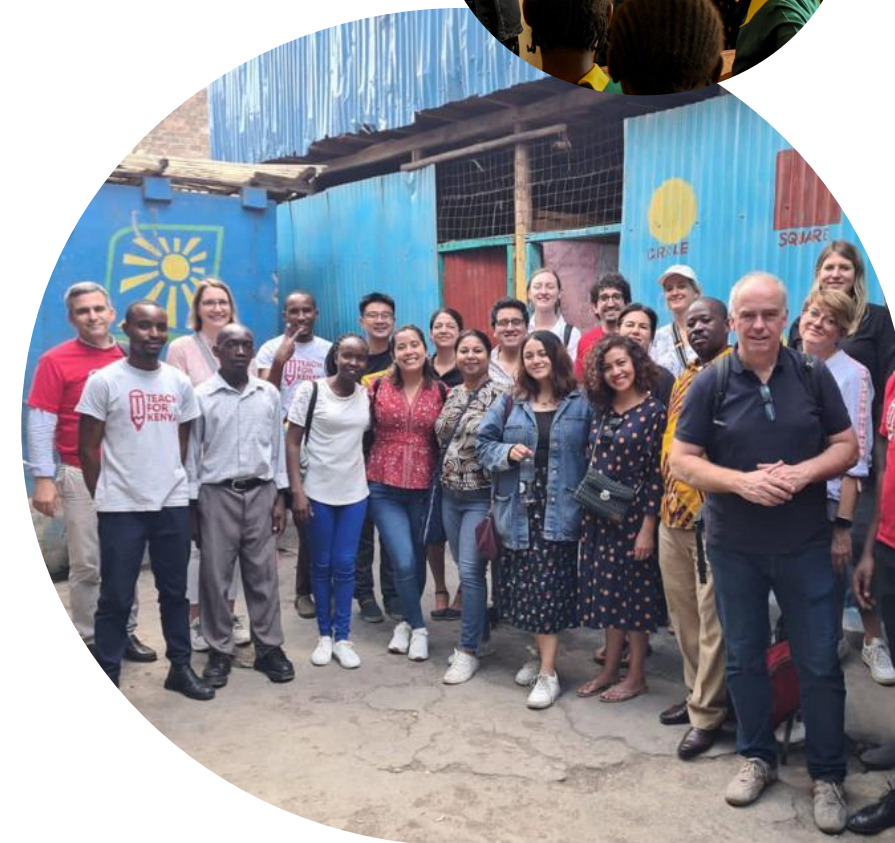
Pictures from DPDHL's visits to two Teach For Kenya schools in Nairobi, Kenya