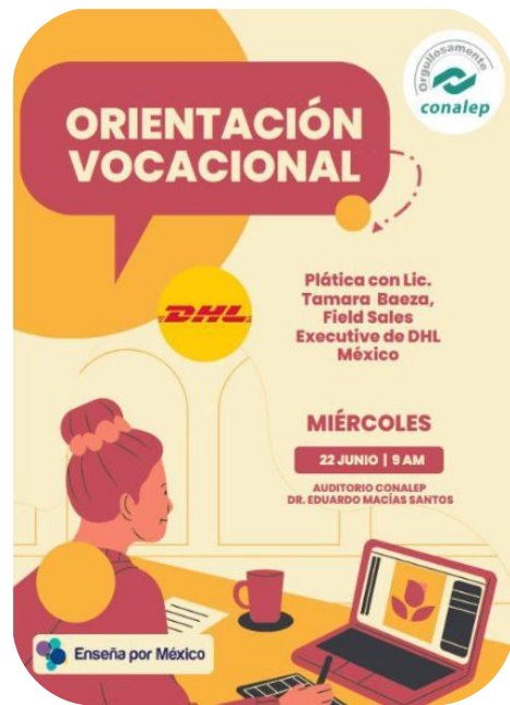
Picture from one of Enseña por México's EmplaLabs

Teach For All network partners worked with their local DHL offices to find ways to integrate employability skill-building into their core programming or through specific future-focused career education events.