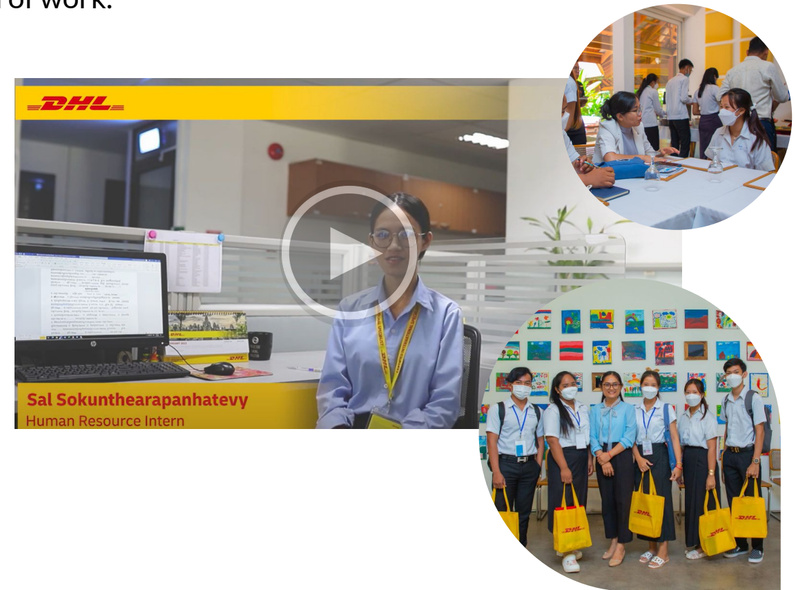
Pictures from Teach For Cambodia's Employability Youth Camp

Teach For Cambodia and DHL Cambodia offered, for the first time, internship opportunities to students who were alumnus of Teach For Cambodia's Youth Employability Initiative. After considering over 200 student applicants, 10 were shortlisted to submit CVs and participate in a virtual information session followed by a 15-minute interview. Five interns were selected (all females) , ranging in age from 18-21, attending different universities and majoring in banking and finance, international relations, and law. Watch the video to the right to learn more!