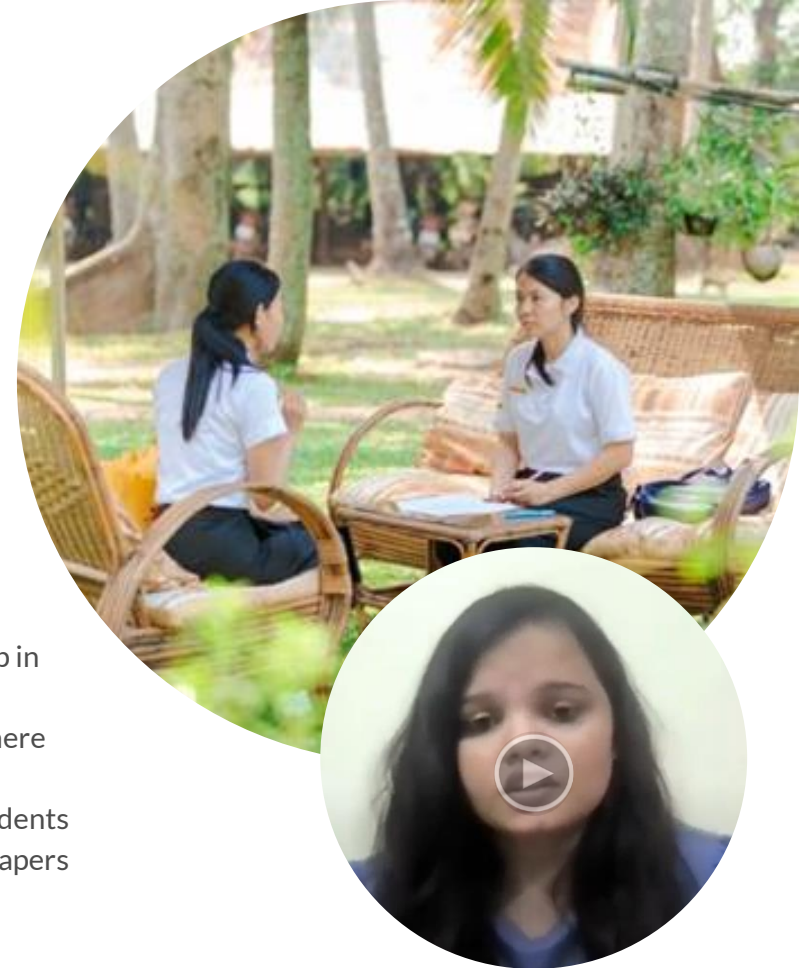
Picture from Teach For Cambodia's women's leadership workshop (top) and video testimony about Teach For India's Bridge Program (bottom).

During Teach For Cambodia and DHL's 3-Day Youth Camp this year, DHL volunteers lead a women's leadership workshop where they first engaged students in a Privilege Walk. This activity prompted students to reflect on the ways society privileges some individuals over others. Afterwards, 3 Senior women DHL leaders shared their stories about overcoming challenges and barriers in their career. Their stories raised students' awareness of gender inequality , especially in the workplace. The male students in particular, shared afterwards that they hadn't considered the challenges their female peers face.